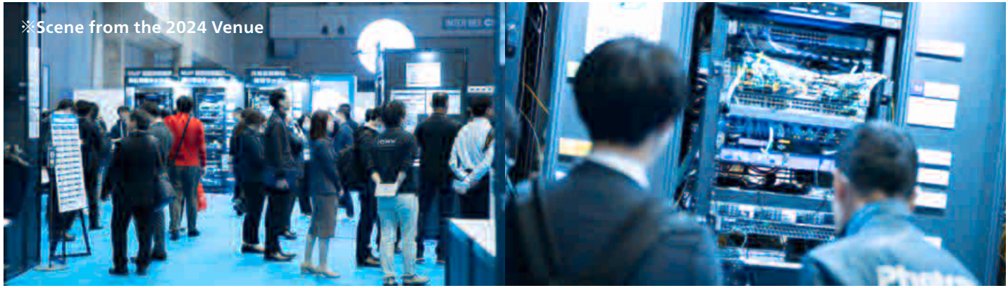
※Scene from the 2024 Venue